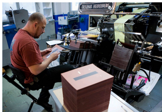
Hot foiling operation.

Since the carrier film reacts with the foil due to the pressure and heat of the stamping process, the composition of the paperboard surface is crucial for providing good runnability and satisfactory bonding of the foil. The paperboard surface must be very smooth and free from impurities and spray powder.