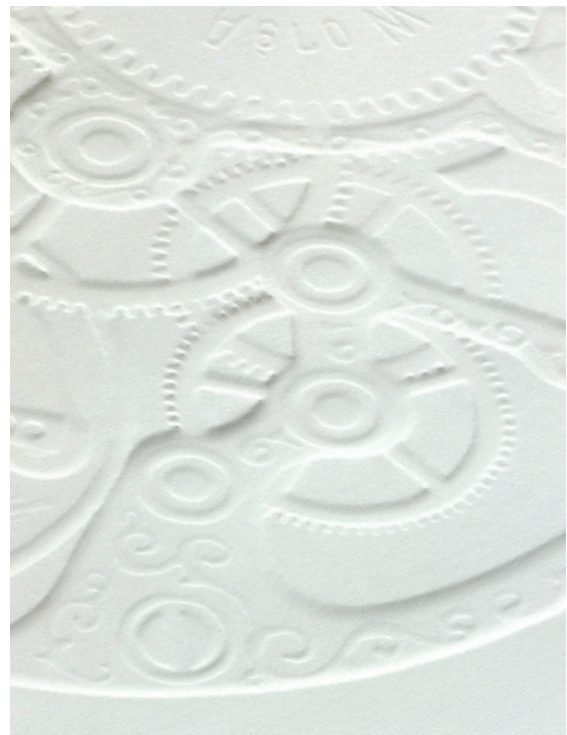
Embossing and debossing may be carried out either "blind" or combined with other techniques.

A relief pattern can be 0.15 to 2.5 mm high or deep. If the relief has only small differences in levels, the possible machine speed will be higher and stacking the finished sheets will also be easier.