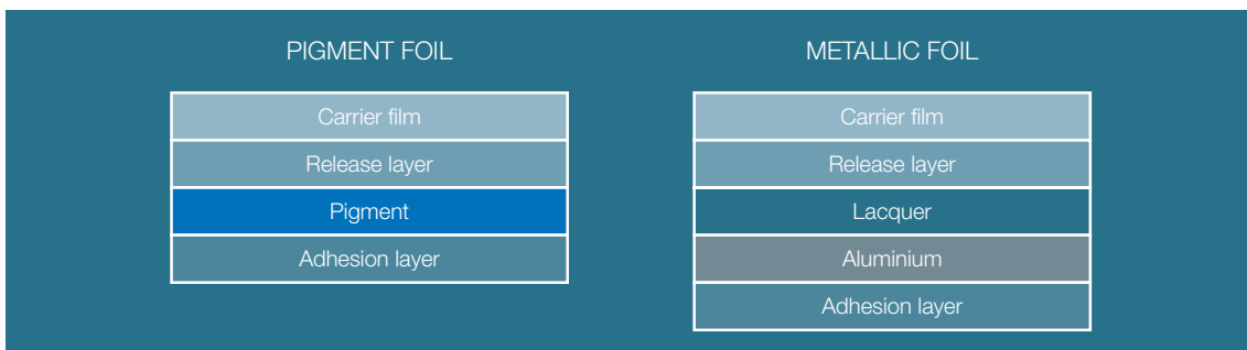
Different film compositions.